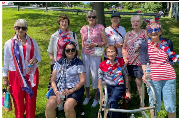
Showing our colors on the 4th of July. Members of our Parade contingent